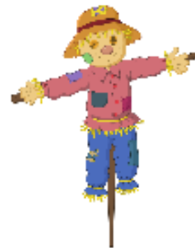
Scarecrow Sept 16 to Oct 6

Pick up supplies in the Children's Room to make Grab & Go crafts at home, while supplies last. Step-by-step video tutorial on our Facebook page ( @waterfordpubliclibrary ).